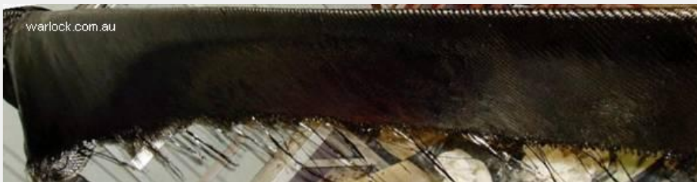
Figure 8. Blade after being covered in uni-directional carbon fibre

400g bi-axial glass cloth was wrapped around the blade and fibre glassed in place. It was lightly sanded before applying another layer of chop strand matt.