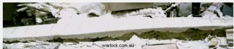
Figure 4. Skeleton filled with polyurethane foam

The skeleton was filled with expanding polyurethane foam (1kg Suprasec 5005, 1kg Daltolac GP33) and sanded into shape.