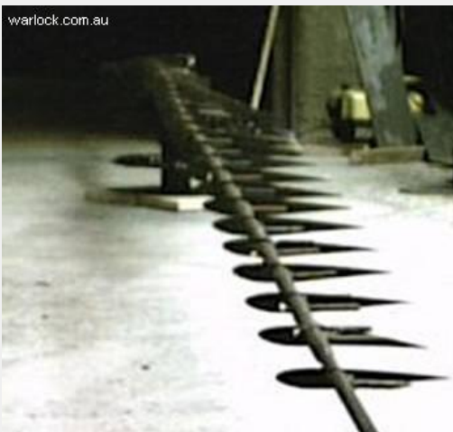
Figure 3. Skeleton airfoil blade two

The steel airfoil cut-outs were welded on steel tube, with the angle set using a protractor against a plumb line.