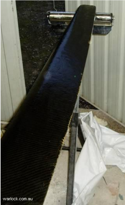
Figure 9. Blade after sanding the carbon fibre