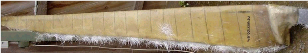
Figure 6. Blade after being covered in chop strand matt fibreglass

The blade was coated in a layer of vinyl ester resin and once the resin had cured, 220 g chop strand matt fibre glass was used to fibreglass the blades. Several layers were used with sanding to ensure a smooth finish.