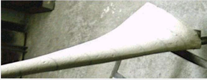
Figure 5. Polyurethane foam blade after sanding